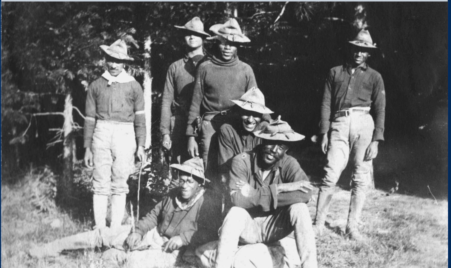
Buffalo soldiers of the 9th Cavalry, while stationed at Yosemite National Park. ca. 1899

Throughout the journey, delve into the history and legacy of the Buffalo soldiers, stewards of this incredible landscape who created the foundation for the National Park Service, conservation, habitat restoration, and ultimately served the public good of all Americans, regardless of color or ethnicity.